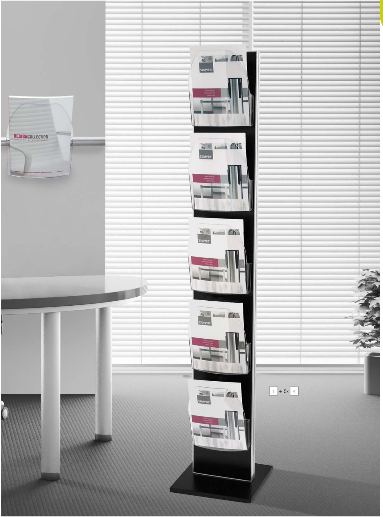
1 + 5x 4